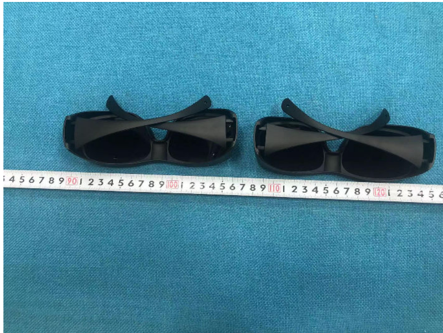
Photo 4 General appearance of the EUT