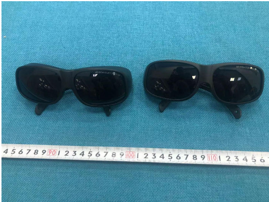
Photo 2 General appearance of the EUT